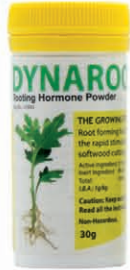
Dynaroot No. 1: Softwood cuttings. Reg No.: L7843 Act 36 of 1947