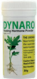
Dynaroot No. 2: Semi-hardwood cuttings. Reg No.: L7553 Act 36 of 1947